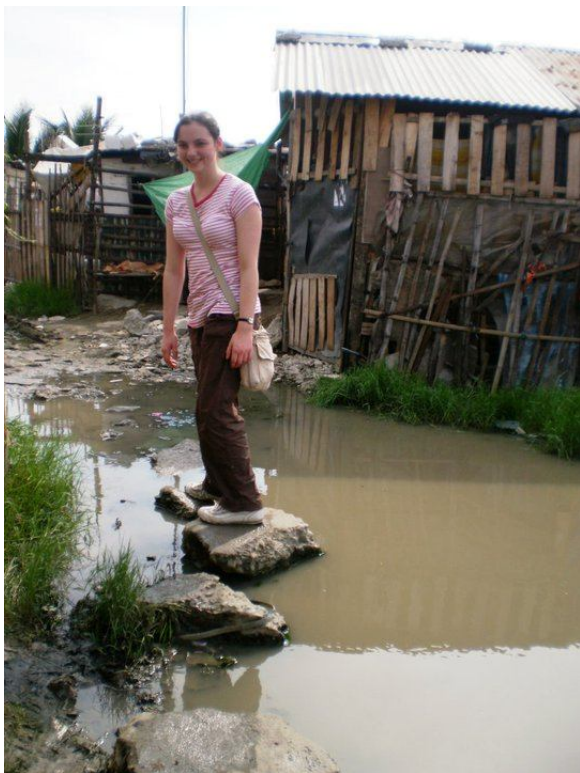
This is how we had to get to one of the houses.

I just want to add that the way it is looking at the moment we will not be badly affected by the typhoon, we will have some rain and wind; but we have had a short power cut already. Please pray for those who have fled their homes in the North.