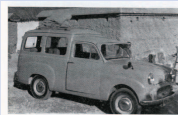
Morupatti van which is used as a mobile book shop and enables Mr. and Mrs. Champion to reach the villages in their area.

I opened out a pair of compasses to a three mile stretch on the map, put the steel point on Morupatti and drew a circle in pencil enclosing, if my arithmetic is correct, about twenty-eight square miles of country. I then counted the villages I had encircled, and found that I had netted twenty-six, or almost one for each square mile. Inside the circle there were three large villages of three or four thousand people each, and if the other villages may be assumed to have two to three hundred people each (Morupatti has about 500), we must have clustered round us about 15,000 people, hardly any of whom are Christians; and no doubt several thousand of them were not even born when we first came to Morupatti in 1957. If instead of stretching the compasses to a mere three miles I had opened them out to six miles, I supposed I should have encompassed about 100 villages with a population of some 60,000 persons, and it would still have been true that nearly all of them would have been strangers to the Gospel